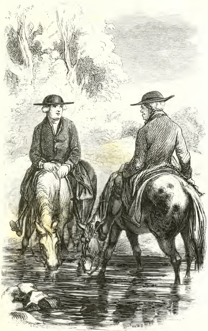
“HOW ARE YOU, PRIEST?” “HOW ARE YOU, DEMOCRAT?” Vol. I. p. 130